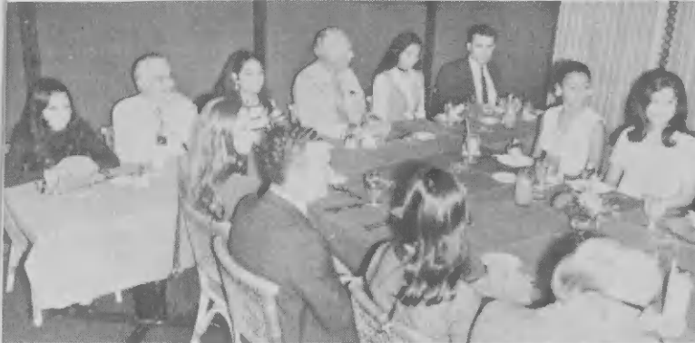
Aruba queens and runners-up on Lago's 1971 calendar honored at dinner in the Coral Strand Hotel.

Reinas y runners-up riba kalender di Lago pa 1971 honra na un comida den Coral Strand Hotel.